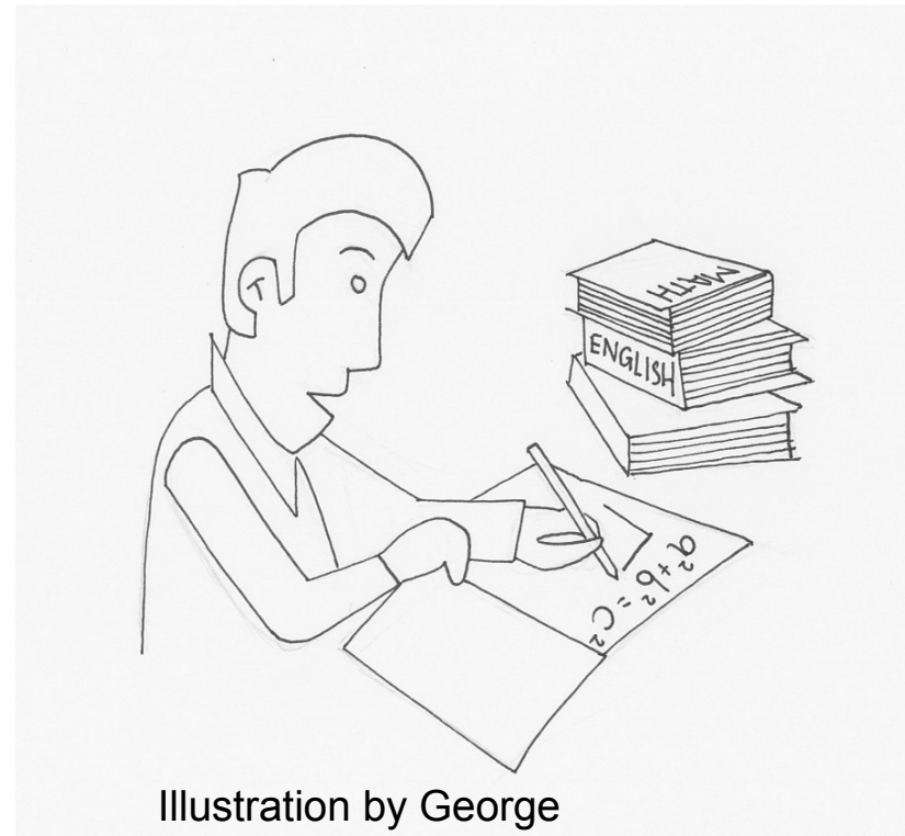
Illustration by George Diamandis